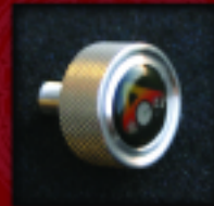
SILVER KNOBS - available on silver and black sight